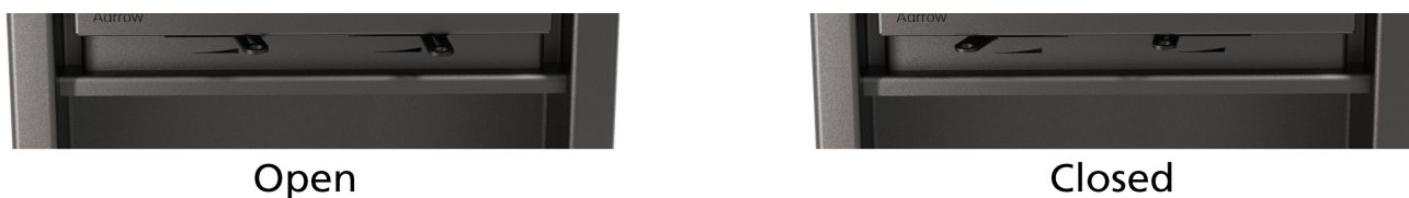
Figure 3: I Series air inlet controls (freestanding model shown).