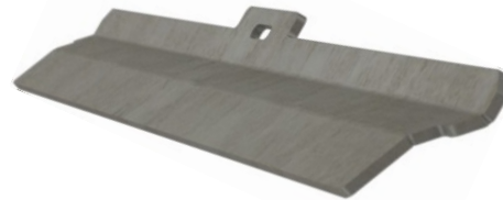
Rear cleaning / access plate